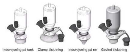
Indsvejsning på tank Clamp tilslutning Indsvejsning på rør Gevind tilslutning